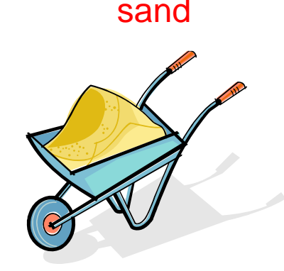
"What would I have to do if I accidentally said 'hand' for this one? I would have to do a ..." [fixed-up-one]