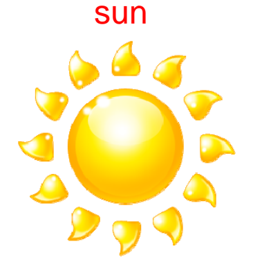
Would I have to do a fixed-up-one if I said 'hun' for this one?"