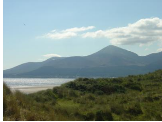
Mountains of Mourne