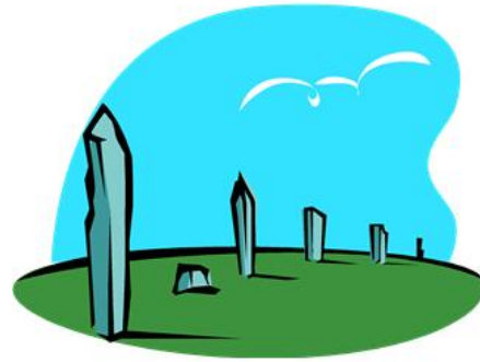
Ring of Brodgar