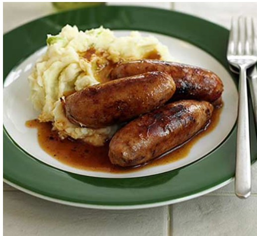
bangers and mash