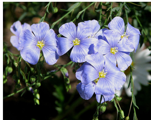
flower of flax