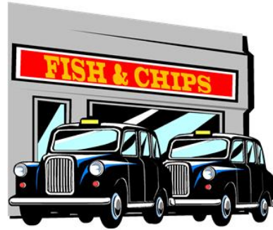
fish and chips