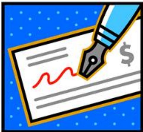
cheque | check